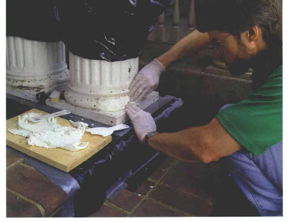
The rest of the hole is filled by hand. Epoxy paste is packed into the repair by hand until the entire gap is filled.

Epoxies have a limited working time, or pot life, so before I begin mixing, I make sure that I have all necessary tools on hand. The list includes duct tape and 6-mil plastic to protect surrounding areas from drips and runoff, 8-oz. hairdye bottles (the kind with the nozzle top and graduations on the side) for mixing and injecting consolidant, tongue depressors or cedar shims for stirring, tin cans or plastic margarine tubs for brushing reservoirs, a variety of dispos-