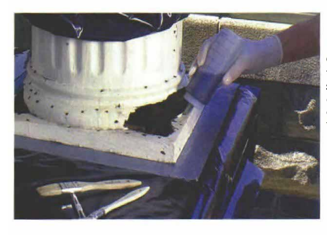
Consolidant is injected into the repair. Liquid epoxy, or consolidant, is squeezed into holes drilled around the repair. The consolidant saturates the soft wood, making it rock hard.

Brushed-on epoxy consolidates exposed wood. In addition to being injected, consolidant is brushed onto exposed wood until it no longer soaks into soft wood.