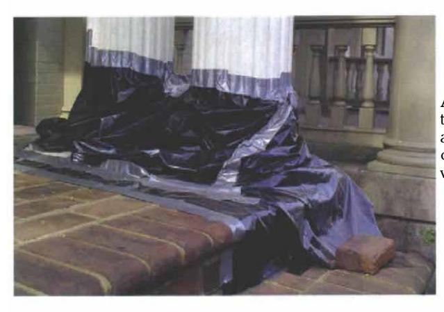
All dressed up. The same poly tent that is used to keep moisture away from the repair while it dries also protects the epoxy from weather while it cures.

A homemade tool for re-creating odd shapes. Irregular profiles such as the fluted bottoms on these columns can be molded using a plastic putty knife with the shape cut into the blade.