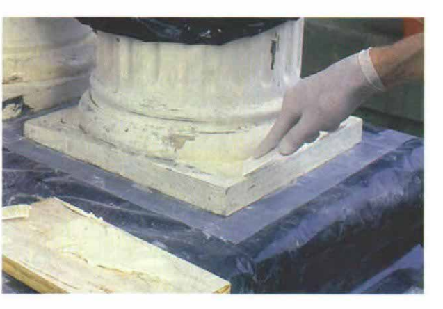
A skim coat touches up small voids. Epoxy filler adheres well to itself, so any small areas left from the initial fill can be skim-coated and blended into the repair.

Primer protects the epoxy. As a final step before painting, a coat of primer is applied to seal the repair against moisture as well as against UV-radiation, which can damage some epoxies.