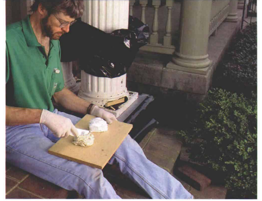
Two-part fillers are mixed on a board. After measuring the right amount of resin and hardener paste, the two are kneaded together on a scrap of plywood.