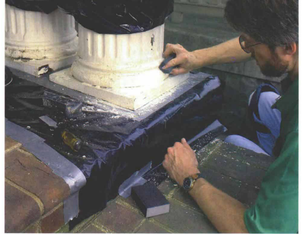
Woodworking tools also handle epoxy. Cured epoxy can be worked like wood. A chisel and a Surform plane rough out the shape, and sandpaper does the smoothing.