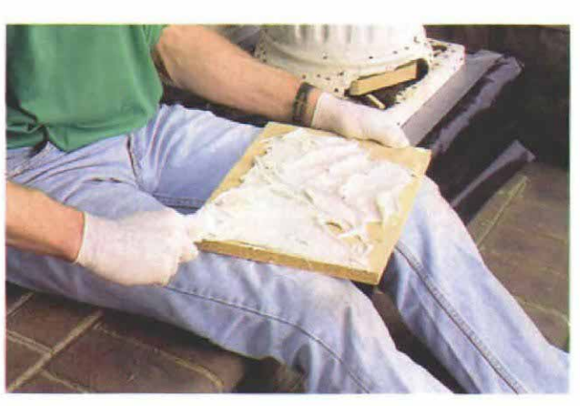
Keep the paste thin to prolong pot life. Epoxy cures more quickly if left in a large mass. To lengthen working time, the mixed epoxy is spread out in a thin layer before the filling begins.

Wood blocks save on epoxy. To keep from using large quantities of expensive epoxy, blocks of wood are encapsulated in the epoxy to act as aggregate.