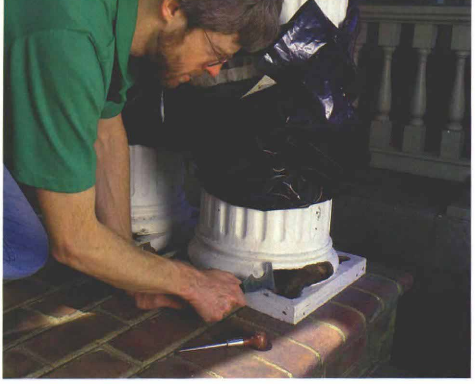
Getting down to sound wood. The first step is removing loose, crumbly wood. A five-in-one painters' tool and an awl are best for digging out any wood that is not still firmly attached.

Epoxies can also be used for major structural repairs such as rebuilding the tenons on large beams in historic timber frames. In these repairs a special epoxy that cures harder than conventional epoxy is combined with gravel, fiberglass-